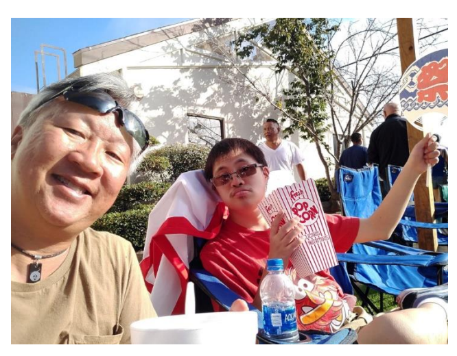
Taking in some refreshments before dancing @ WLABT

run, little pup," and he always greets you with a handshake and a wide smile when he sees you.